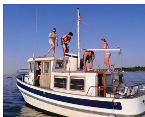
An inside look at Baltimore party boat culture