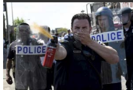
A police officer uses pepper spray to disperse a crowd in Baltimore, and more of our top photos from the last 24 hours. Slideshow »