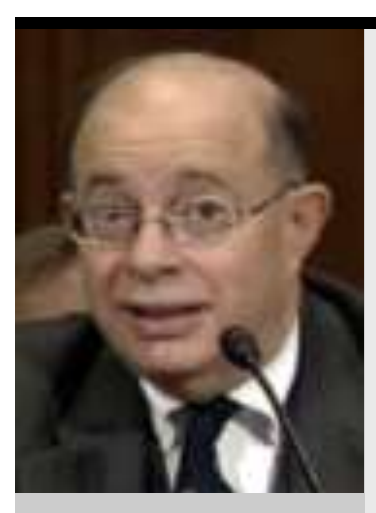
Evan J. Wallach Judge, United States Court of Appeals for