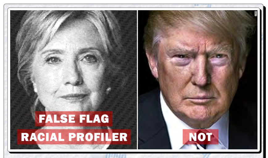
FIG. 1--HILLARY CLINTON pounced on Donald Trump's suggestion to temporarily stop immigration from troubled Muslim countries until America develops a way to identify anti-American ISIS and Al-Qaeda allegiances. Trump's detractors called the suggestion racist profiling, conjuring up America's controversies surrounding racial profiling. The illogic of not weeding out people dedicated to destroying America aside, Hillary's accusations are a false flag to hide her massive racial profiling activity.

CONTRIBUTING WRITERS | OPINION | AMERICANS FOR INNOVATION | JUN. 24, 2016 | PDF