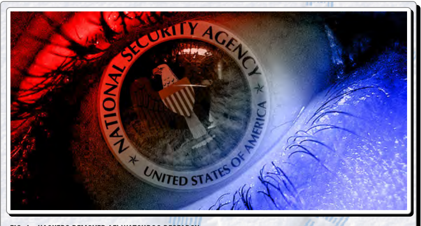
FIG. 1—HACKERS REMOVED AFI WATCHDOG RESEARCH. The topics of the documents deleted show other watchdogs what and who to focus on: proofs of the theft of Leader Technologies' social networking invention as the platform for government racketeering, in collusion with private companies, to take over global digital communications infrastructure.

CONTRIBUTING WRITERS | OPINION | Americans for innovation | May 20, 2016, Updated Jun. 07, 2016 | PDF