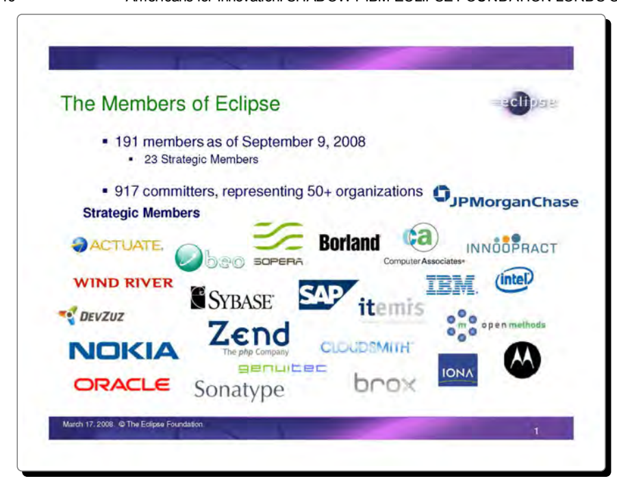
FIG. 4—IBM Eclipse Foundation Members, page 1, prepared as of Sep. 09, 2008 and reported to the Board of Directors on Sep. 17, 2008. Click here for image of page 2. Read more here.

By 2008, Eclipse boasted 191 members—a veritable Who's Who of technology companies, their banks and mutual funds, and their federal government cronies, including IBM, Google, Alphabet (Google), YouTube (Google), SAP, Oracle, Sybase, Rational, HP, Wind River, Intel, Motorola, Hitachi, Samsung, Nokia, In-Q-Tel (C.I.A.), National Security Agency (NSA), National Venture Capital Association (NVCA), Fidelity, T. Rowe Price, Vanguard, Morgan Stanley, EMC, Dell, Facebook, Instagram (Facebook), LinkedIn (Facebook), WhatsApp (Facebook), Square (Facebook), Squarespace (Facebook), PayPal, Goldman Sachs, Togethersoft, Borland, QNX, Qualcomm, Xerox, Micron Technology, Cisco, Netflix, Apple, AOL, Kleiner Perkins, Yahoo, Tumblr (Yahoo), Flickr (Yahoo), Twitter, Computer Associates (CA), Microsoft (via University of Washington), Nokia (Microsoft), Siemens, IDG, BEA, AMD, NetApp, NEC, Compuware, Novell, Blackberry, TIBCO, SAS, Toshiba, Texas Instruments, Tsinghua University (Beijing), Wells Fargo, Honeywell, UBS, Credit Suisse, Deutsche Bank, Barclays, State Street Corp, Bank of America and JPMorgan.