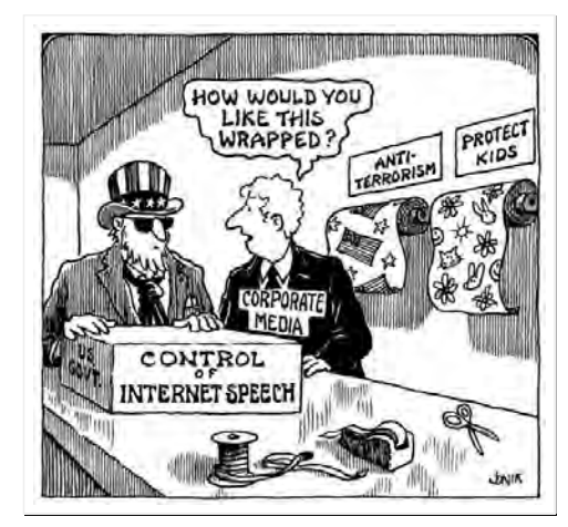
FIG. 4 —Do the IBM/Eclipse/NSA/Facebook Cartel and the Obama administration plan to seize control of the Internet before this administration leaves office? Seems they do. Blanket NSA metadata collection facilitates that goal since it allows IBM, Eclipse members, including Facebook, to know everyone's connections and networks, intimately. Once they know your networks they can control you. The agenda here is utterly immoral, yet packaged in a floury national security or protect-our-kids rationale.