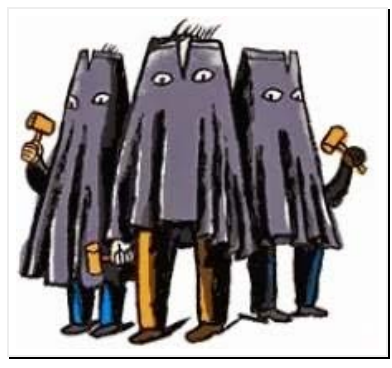
FIG. 1—FISA COURT has expanded its powers over our entire national communications infrastructure, unilaterally-without public debate. Does this conduct have the distinct odor of Harvard / Ivy League hubris? See the list of likely participants below.

Ask yourself, why would our U.S. iudicial officals let these people get away with this abuse of the U.S. Constitution unless they were in on the hijacking?