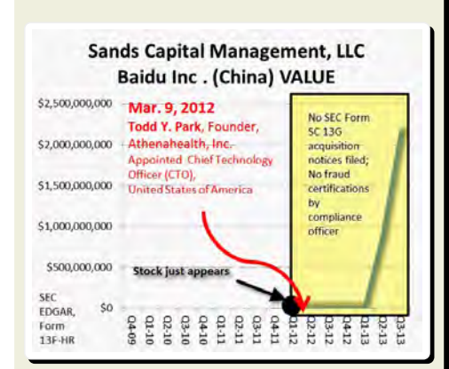
FIG. 5—SANDS CAPITAL MANAGEMENT, LLC BAIDU, INC. HOLDINGS, SEC EDGAR. The yellow highlighted box shows that no acquisition notices and no-fraud certifications were filed. In short, Sands Capital acquired over $2 billion in Baidu stock without regulatory oversight. These holdings commenced concurrent