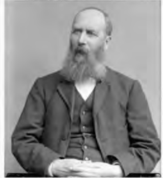
Douglas Brymner, 1892